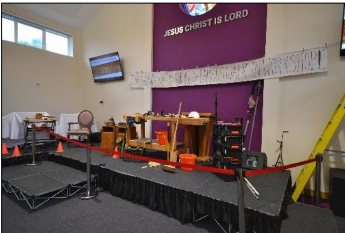
The wonderful world-famous walk-in workshop!